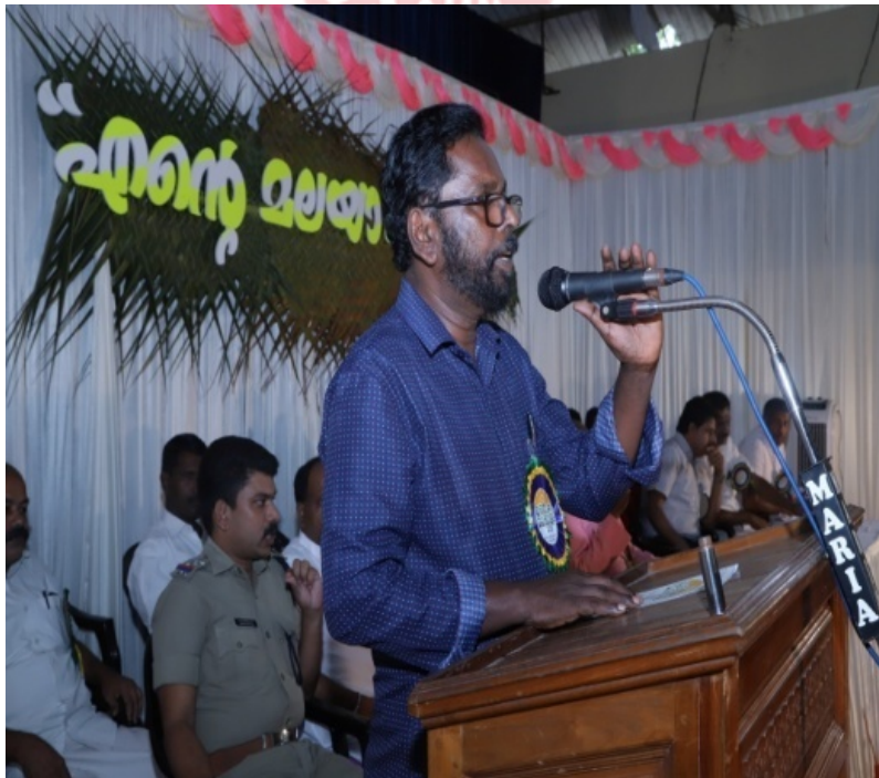
Kaviarangu organised by Malayalam department

(VI) Oral History Archiving is an initiative of the Postgraduate department of History to collect, record, and preserve the history of the nameless, marginalized and down trodden, who has never been part of the recorded or written history. So far more than fifteen interviews were conducted by the students of the History Department. The department tries to collect and preserve, both oral tradition and oral history, otherwise lost forever.