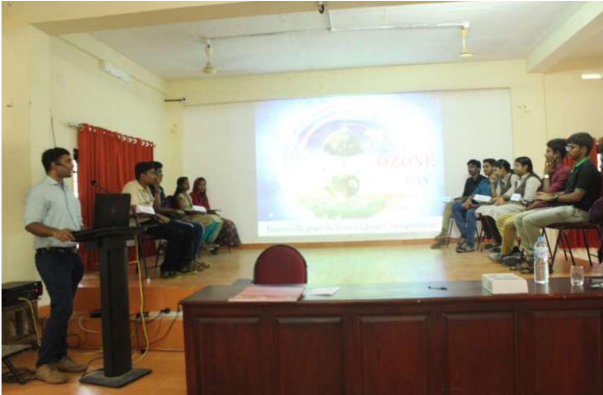
Intercollegiate quiz on World Ozone Day (KSCSTE sponsored) and national science day