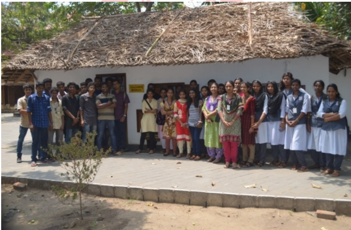
Sahodaran Aiyappan's House

B. Voc. Tourism and Hospitality Management students visited unexplored tourists spots of Kottayam District like IllickalKallu and Kattikayam Waterfalls, and Rosmala and recorded a