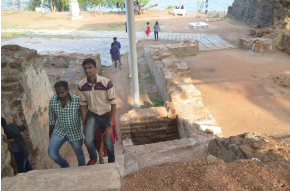
Field visit to Pallipuram Fort