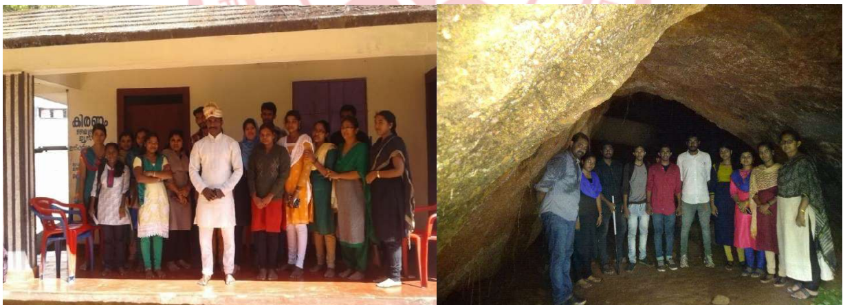
Visit to Kovilmala tribal settlement and Cave at Mankombu by History students

Tribal visits, Heritage Walk and visits to Archeological and Megalithic Sites provide the History students abundant opportunities to explore the culture, custom, beliefs and practices of tribal people.