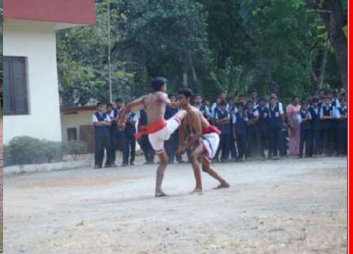
Demonstration of Thamper , traditional art performance of Malai Arayan community and Kalaripayattu